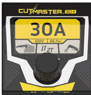
Simple and intuitive TFT LCD panel