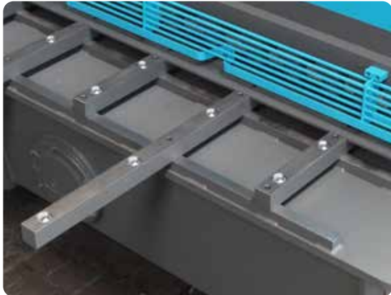
Ball transfers mounted in the iron table blocks, for easy feed-in of the sheets.