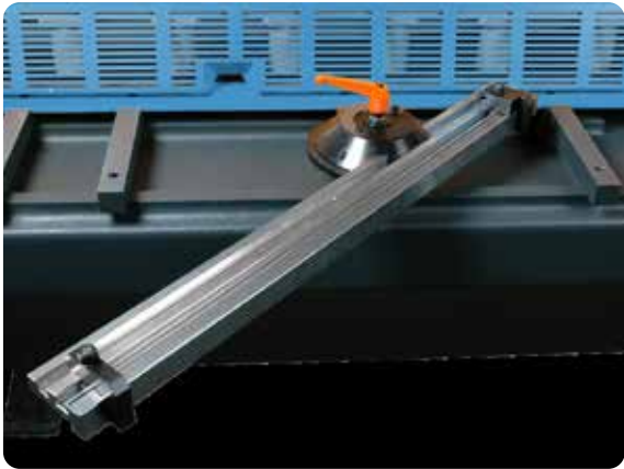
Protractor for angle shearing.