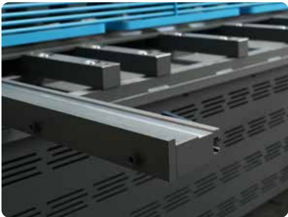
Squaring arms and front support arms with or without scale, T-slots and tilting stop. Lengths from 1000 up to 3000mm.