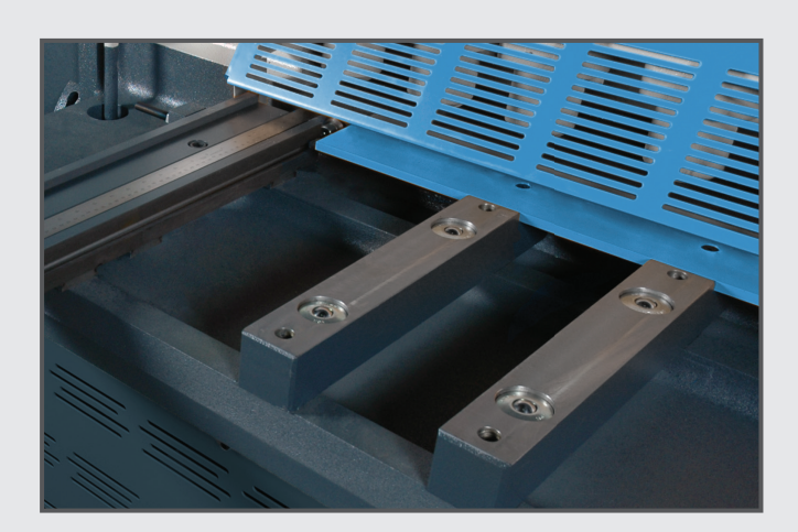
Ball transfers mounted in the iron table blocks, for easy feed-in of the sheets.