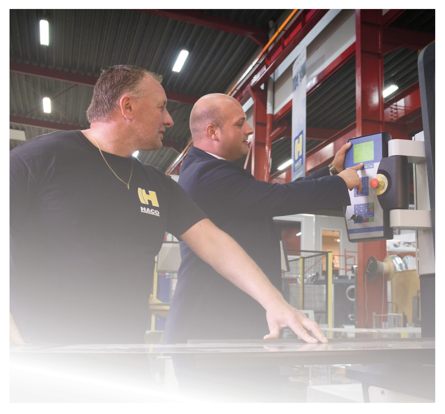
TS / TS(X) Hydraulic guillotine shears