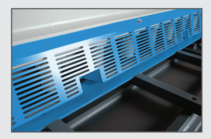
Hand safety guard with hand gaps for handling small sheets.