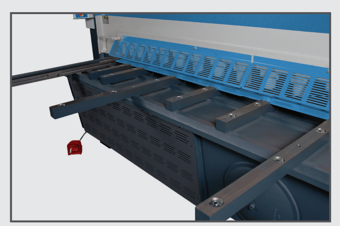
Squaring arms and front support arms with or without scale, T-slots and tilting stop. Lengths from 1000 up to 3000mm.